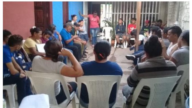
Gathering of young people to introduce them to the social programs being carried out by the Mina la India project.