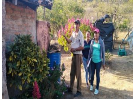
Picture 11: Visits to housewives participating in the Cleaner House contest