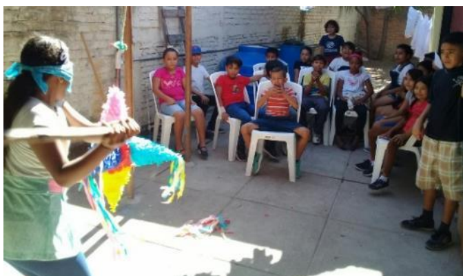
Celebration of the birthdays of the first quarter of the year 2020