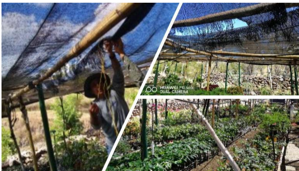
Photograph 3.2.2.b. Repair of the tree nursery “Oro Verde” infrastructure.

Due to the strong winds, the tree nursery infrastructure was damaged and required improvement and repair: the mesh, bamboo infrastructure were changed and repaired. Other improvements are underway.