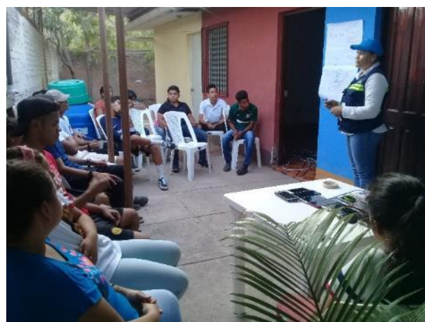
Presentation of the Tatiana and América secondary projects to young people from the Youth in Action program.