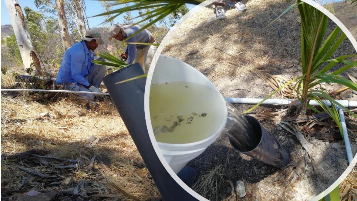
Photograph 3.2.3.1.a. Maintenance and watering of company's area (101 fruit trees) implementing an alternative irrigation system.

Maintenance of reforestation areas in Nance Dulce, Los Rastrojos, and within the company's property continues. This activity is required to ensure the survival of the trees planted and are part of the environmental commitments of the company in the La India environmental permit. This maintenance includes watering and fertilizing, weed removal, fencing and firebreaks to protect the area of potential forest fires.