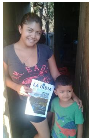
Picture 5: Delivery of cannisters and the La Voz de la India magazine