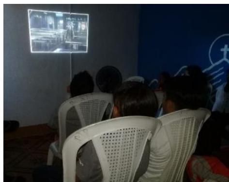
Movie afternoon with the theme: The house I must take care of.