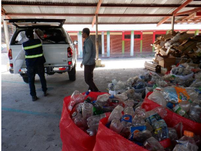
Photograph 3.2.1.3.a. Recycling material delivered to Los Pipitos program

Activities related to waste management continued in La India concession and in the company's premises during this quarter. A total of 50 lb of paper/cardboard, 5 lb of glass and 20 lb of plastic were collected internally for recycling. A total of 140 lbs of cardboard and 49 lbs of paper were delivered to Los Pipitos program that were in temporary storage. General waste generated was about 550 lbs and 120 lbs of organic waste were used for composting.