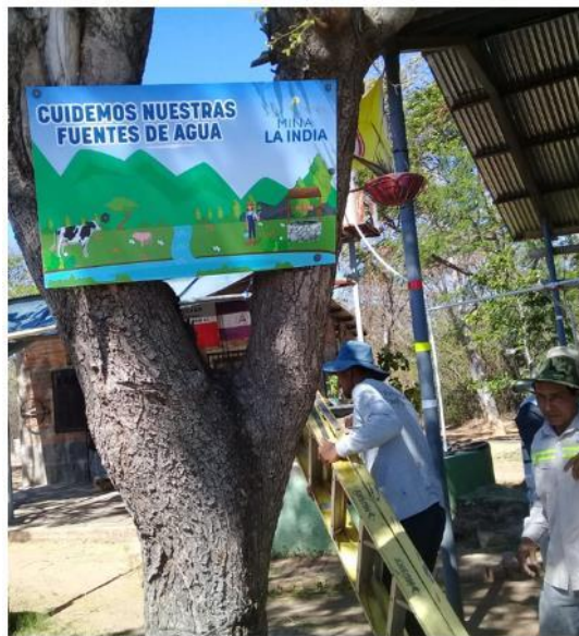
Photograph 3.3. Maintenance and installation of sign in the reforestation area in Soledad de la Cruz village.

In March, a donation was made to San Isidro municipality and INAFOR for the Inauguration campaign of the Forest Fire Prevention.