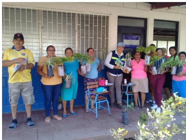
Photograph 3.2.1.2.e. Plants donation to Agua Fría villagers during presentation of results of the water quality monitoring

In Agua Fría village the Company also donated plants.