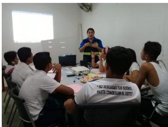
Workshop on writing a script for short films.