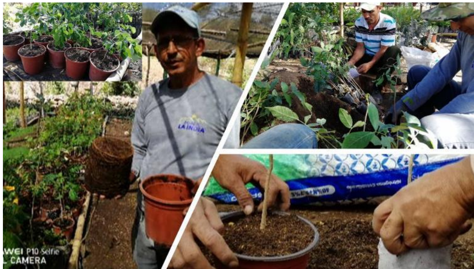
Photograph 3.2.2.a. Tree nursery work

A total of 7106 plants are watered, fertilized and cleaned of weeds and pests as part of the maintenance program of the tree nursery Oro Verde. 70 plants were donated to INAFOR – Achuapa (La Cuchilla concession) for their Arboretum project; 60 plants were donated in a social program.