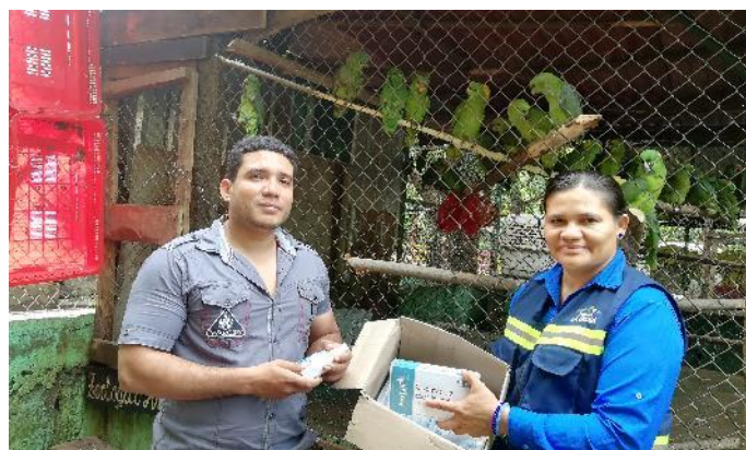
Photograph 3.2.1.4.a. Monthly donation to Zoo in León.

As part of Condor's commitment to the protection of biodiversity, a monthly donation to the Arlen Siu Zoo in León was implemented since last quarter 2019. These include seeds, medicine or other requirements, which are delivered in collaboration with MARENA-León.