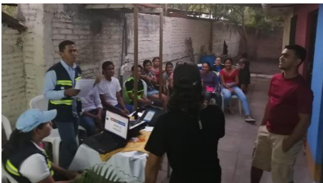
Meeting to start the year by strengthening the relationship with the youth sector of the village