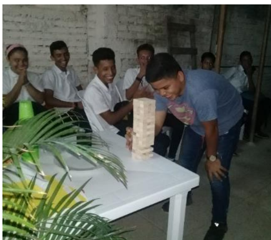
Friendship Day celebration with an emphasis on the safe management of social networks.