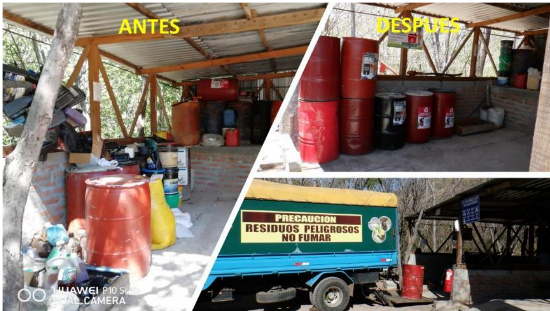
Photograph 3.2.1.3.c. Hydrocarbons area cleaning, before and after pickup of the authorized company for hydrocarbons management

An inventory of hydrocarbon waste was completed, as well as cleaning of the storage area and a certified company was contacted to remove and treat the waste.