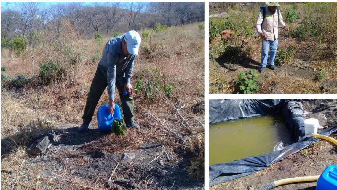
Photograph 3.2.3.1.b. Maintenance and watering Los Rastrojos reforestation area