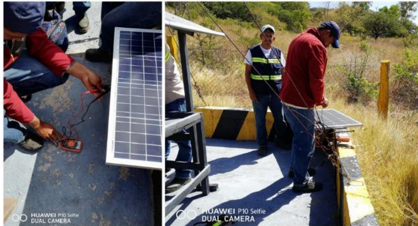
Photograph 3.1.1.a. Solar panel for the digital weather station installed in January

During this quarter, the new solar system was installed in January and a new sensor was received and installed in February; guaranteeing the integrity of the data on the weather parameters being monitored.