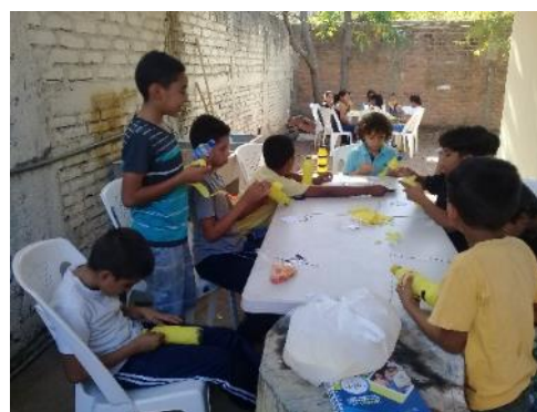
Manufacture of bees with recycled material