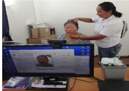
Picture20: Updating of identity cards