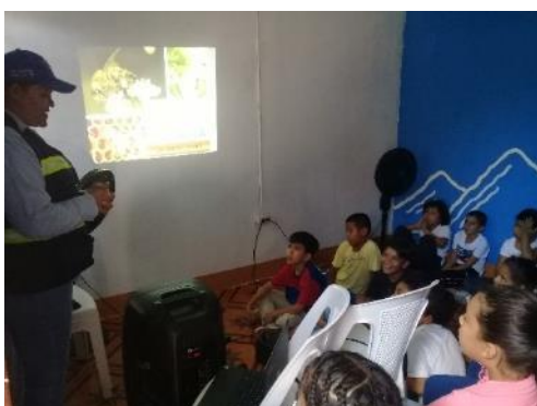
Meeting on environmental education with the theme: How bees produce honey.