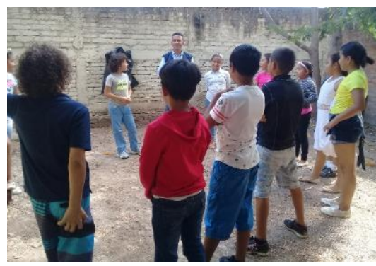
Motivational meeting on the importance of study.