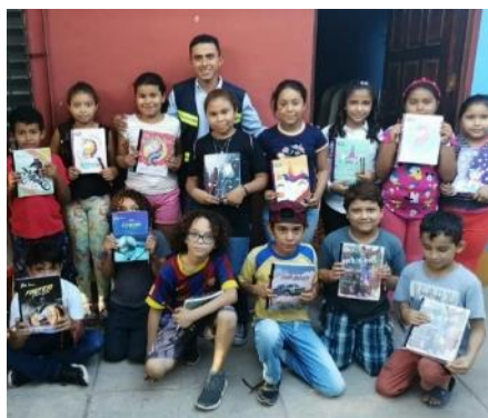
Delivery of school packages to boys and girls of the Happy childhood program.