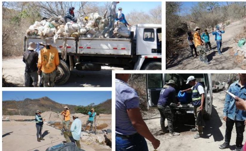
Photograph 3.2.1.3.b. Cleaning day in processing sites

Support was provided to artisanal miners on processing sites, in the establishment of environmental guidelines, cleaning activities and construction of seven metallic containers for recycling. A total of 387 bags of waste were gathered (about 45 lb/bag) and sent to the community waste dump in the first cleaning drive.