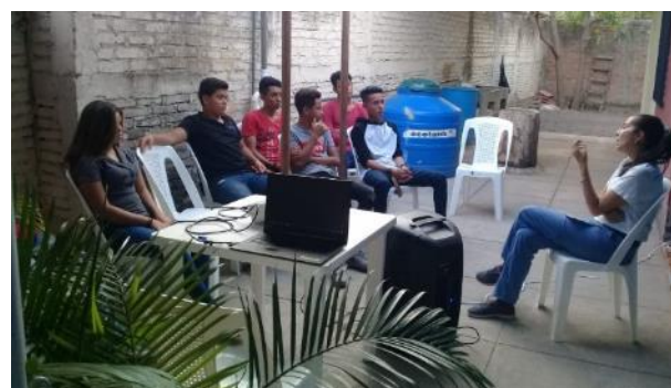
Informative talk on covid-19 prevention