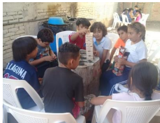
Recreational meeting with board games.