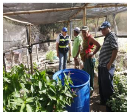
Picture 19 Technical visit to the medicinal garden