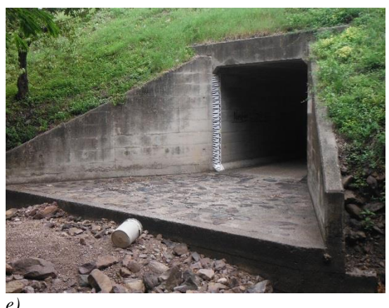
Photograph 3.2.1.a-e. (a) Staff gauge in San Lucas V-notch weir (LIWR001) (b) La Simona Trapezoidal weir (LIWR002), (c) La India Rectangular weir (LIWR004) where the staff gauge has been removed, (d) Alcantarilla and (e) Alcantarilla TSF. Taken 30<sup>th</sup> September 2018.

An inspection of all weirs' sites was conducted to create a description of each weir, status and needs for improvement. A timeline to carry out requisite improvements was created with the assistance of a hydrology specialist. Below the list of the weirs inspected: