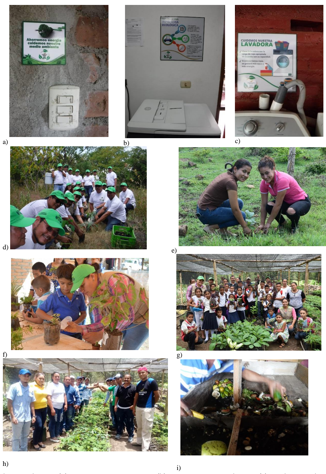
Photograph 3.3.1 (a) Energy conservation sign, (b) Printing recommendations, (c) Washing machine recommendations, (d) International Tree Day reforestation in Espinito-Mendoza. (e) Planting trees with students from the technical courses, (f) Reusing plastic bottles with local children, (g) Kids show their plastic bottles reused in tree nursery, (h) INAFOR reforestation workshop during visit to tree nursery-Condor (i) Vermicompost.