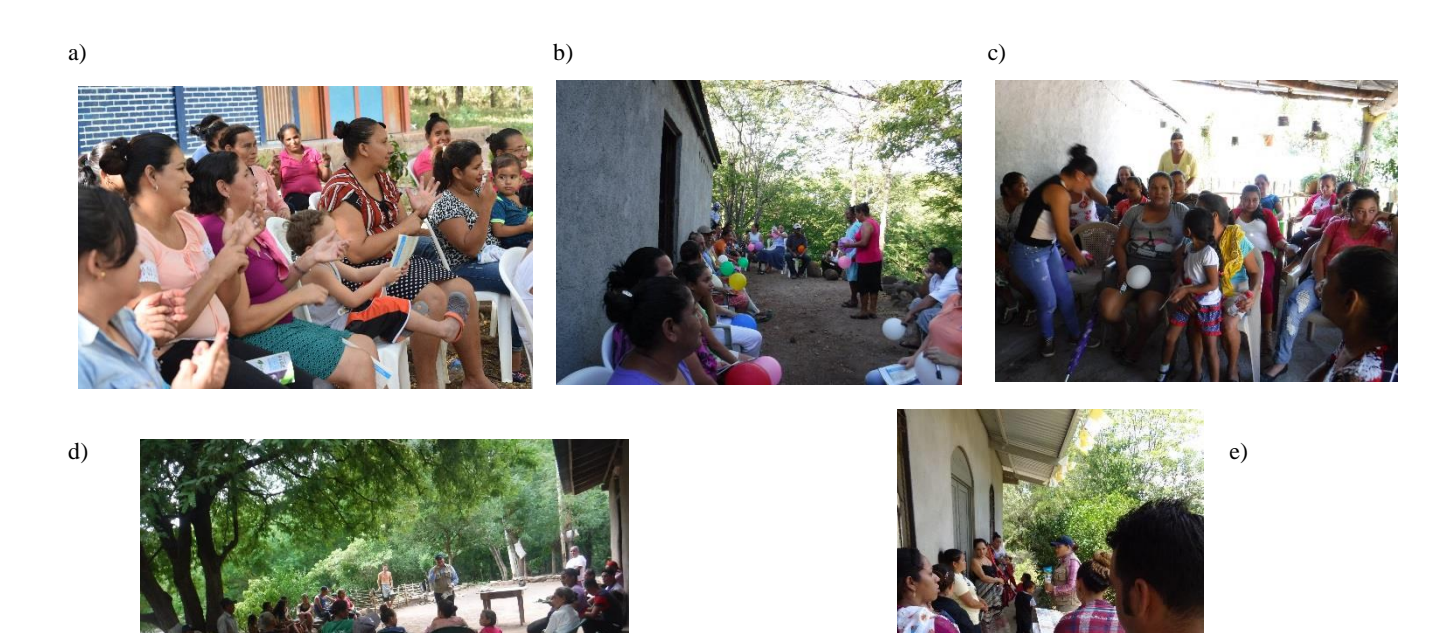
Photograph 3.2.1b. (a) Agua Fría meeting, (b) Carrizal meeting, (c) Nance Dulce meeting, (d) Ocotillo meeting, (e) El Bordo meeting