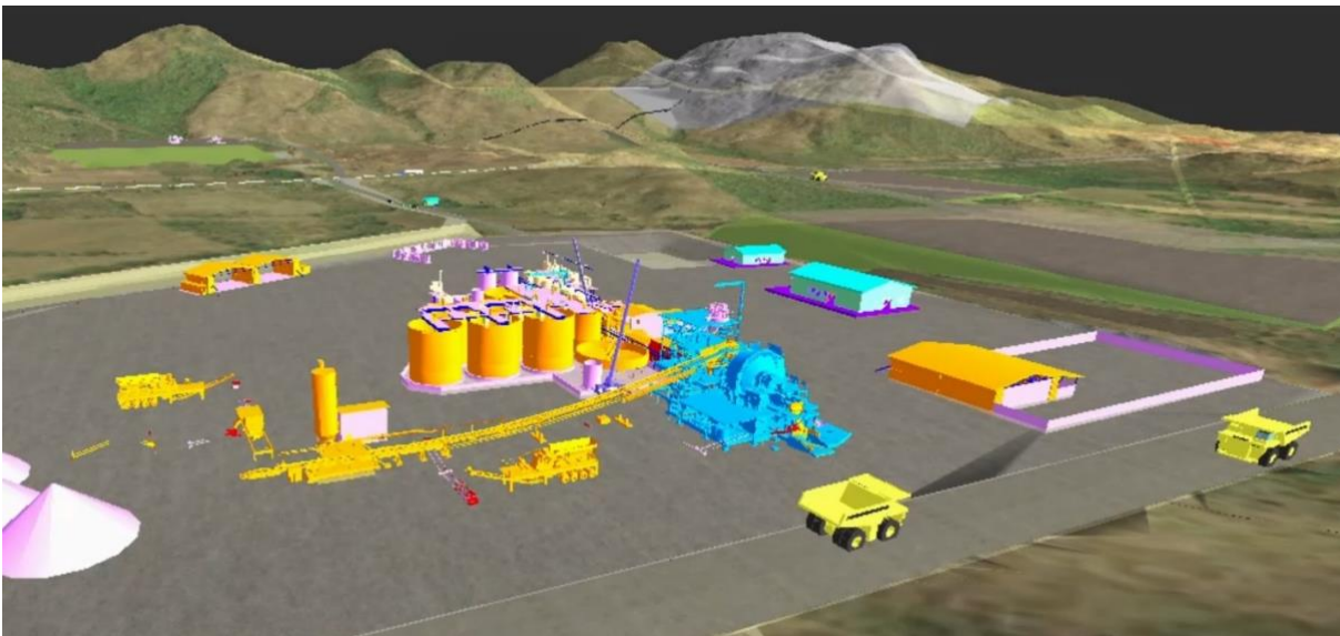
Figure 1: View of Planned 2800 TPD Plant

The Hanlon deliverables included over 100 drawings covering Civil, Electrical, Process flow diagrams and general arrangements, along with the reports detailing the capital cost sections of the FS and the operating costs for the plant area.