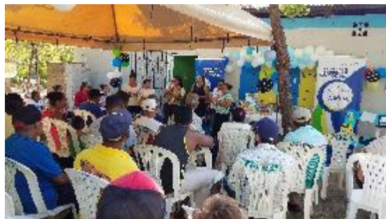
Illustration 19: Celebration of World Environment Day in Santa Cruz de la India.