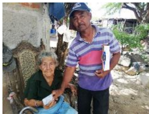
Illustration 203: Delivery of identity cards to people over 65 years of age.