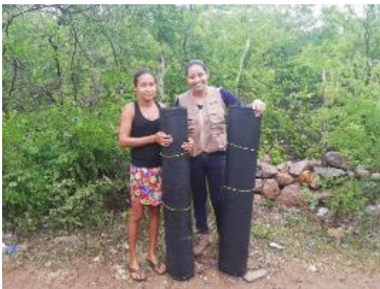
Illustration 17: Donation of plastic for home improvements.