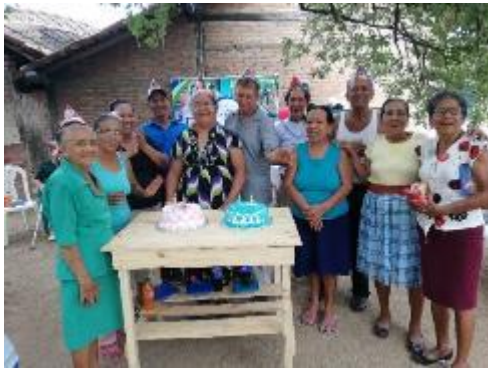
Illustration 224: Quarterly birthday celebrations