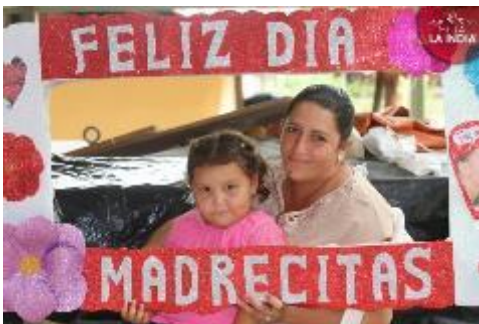
Illustration 24: Celebration of Mother's Day in Santa Cruz de la India.