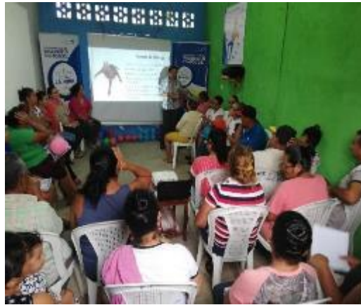
Illustration 17: Workshop on the importance of money saving with program members.