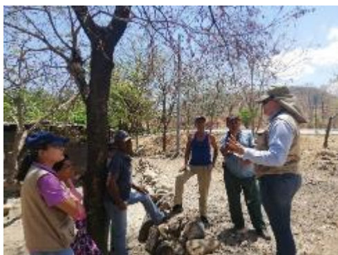
Illustration 192: Installation of medicinal garden in Santa Cruz de la India