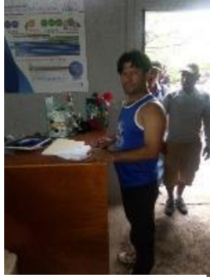
Illustration 122: Delivery of agreements.