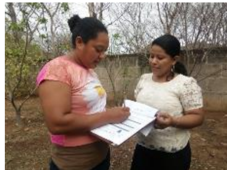
Illustration 25: Registration of members to the Agua Es Vida program.