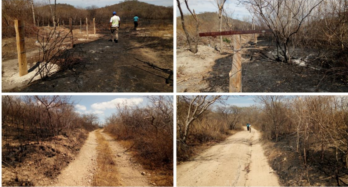
Photograph 3.3.3.1.(a) Forest fire in La Mestiza property in April 2019.

In June, maintenance was carried out in the reforestation area in Espinito-Mendoza and preparation for planting trees to compensate losses during the dry season. Focus will be put on the area which will not be affected by the proposed Tatiana project.