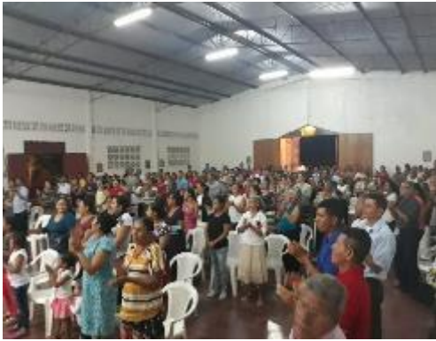
Illustration 26: Healing Vigil in the Catholic Church of Santa Cruz de la India.