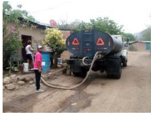
Illustration 163: Delivery of water to homes in Santa Cruz de la India