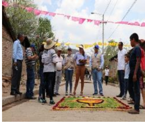
Illustration 27: First contest of sawdust carpets in Santa Cruz de la India.