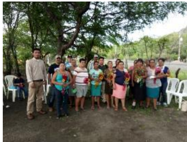
Illustration 6: Celebration of Mother's Day in the El Bordo community.

As part of the Activity, Board members dedicated a few words to all the mothers, and highlighted the company's effort in supporting this kind of activities in which each of the Cooperative miners that are part of the activities are taken into account.