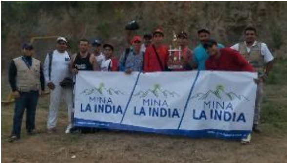
Illustration 9: Baseball League.

As part of the event, there were cultural dances by the Raices Doradas dance group, in addition a raffle of 5 tickets for attendance to the National Stadium took place. Teams were awarded with sporting equipment (gloves, bats and balls) to continue promoting sports in the villages.