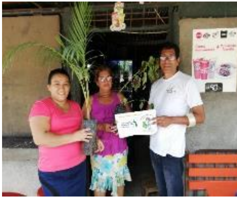
Illustration 29: Exchange of plants for plastic bottles with business owners.