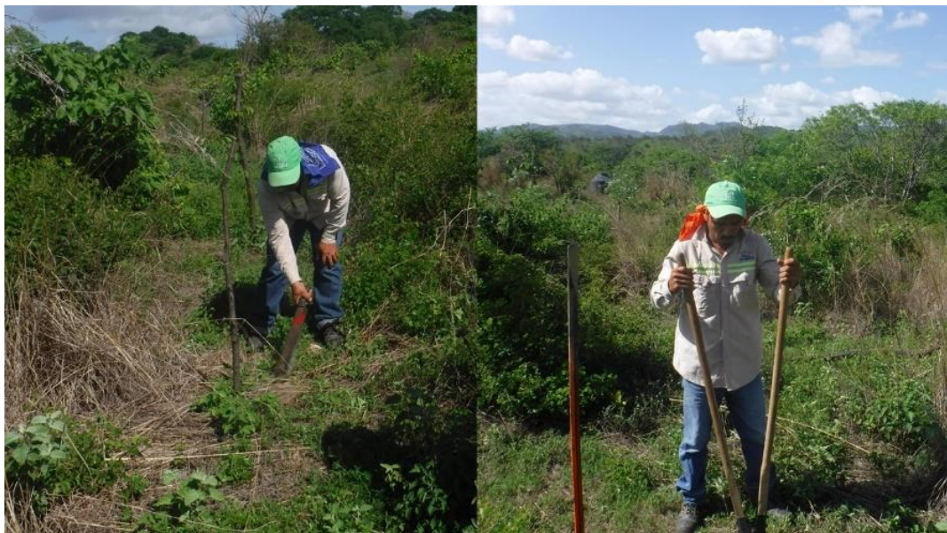
Photograph 3.3.3.1. (b) Maintenance and preparation for reforestation activities in Espinito-Mendoza concession.

A reforestation activity with coworkers will be done on 3 rd July to celebrate Miner's Day and the National Tree Day.