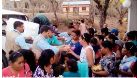
Illustration 5: Delivery of refreshments

2. The “Celebration of the Word of God” in the local Church, delivery of 400 Refreshments and 5 dozen fireworks.