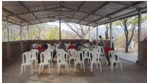
Illustration 100: meeting with group leaders to inform the company's dispositions to issue the new ore extraction agreements in the area of the mestiza.