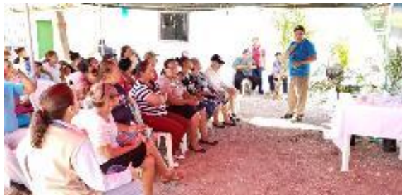
Illustration 151: Celebration of Father's Day in Santa Cruz de India