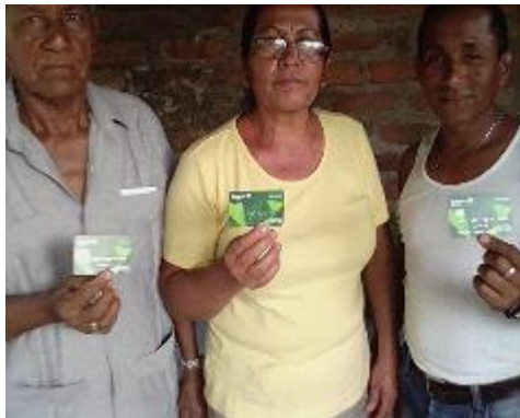
Illustration 30: Opening of savings accounts in the bank, savings program for members of the business program.