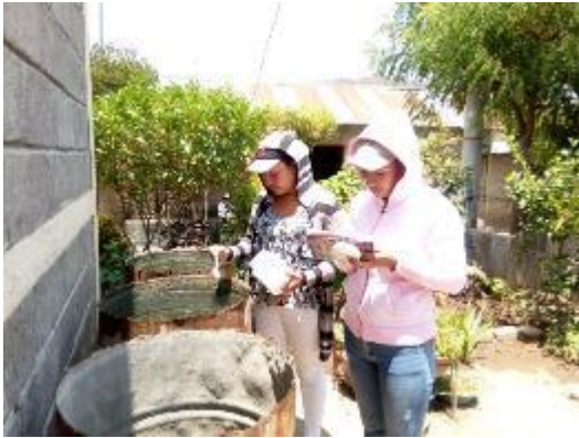
Illustration 22: Abatization in houses of Santa Cruz de la India.