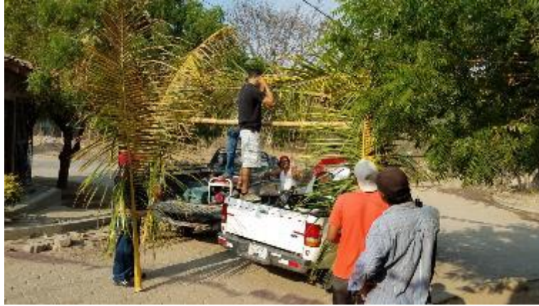
Illustration 3: Portal installation in the first sawdust carpet contest

Sport Activity – flash tournament at Cristalito village with Cooperative Miners. In commemoration of Bordo festivities, in honor of the Virgin of Fatima, a flash baseball league was promoted with the Board of Miners in which 4 teams from Bordo, Cristalito, Rastrojos and Las Pilas villages participated.