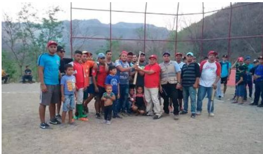
Illustration 4: Flash League organized in celebration of the festivities of El Bordo village

Prizes were provided to the participants: first place (baseball bat and 6 balls), second place (6 balls), third place (5 balls) and fourth place (5 balls). The Cristalito team were the tournament winners.