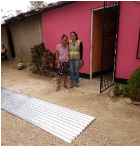
Illustration 1513: Donation of zinc sheets in a beneficiary of Santa Cruz de la India.