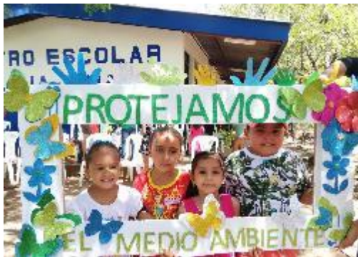
Illustration 18: Celebration of Children's Day and the environment in Agua Fría.