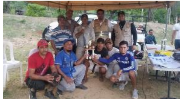
Illustration 8: Team of artisanal miners' La Mestiza, winners of second place.