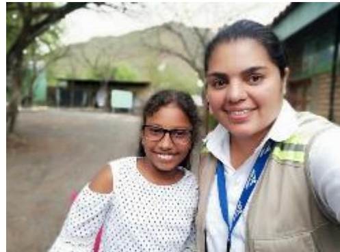
Illustration 1614: Donation of 50% of the cost of the glasses to the beneficiary of Santa Cruz de la India.