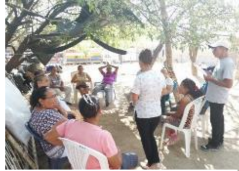
Illustration 3521: Health Circle, talk about arthritis.