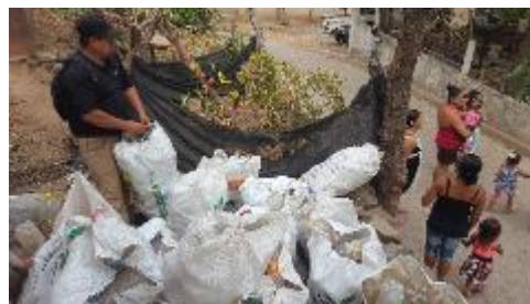
Illustration 1: Environmental Activity Collection of plastic bottles.

Environmental activity. Environmental Activity was conducted in coordination with the environmental area of La India Gold SA and the representatives from El Bordo and Cristalito villages. The activity was carried out with a total of 120 people, 100 bags full of plastic bottles were collected; as part of the activity 2 piñatas were given per community in addition to refreshments. These collected plastic bottles are donated to the NGO Los Pipitos Organization.