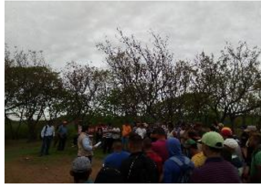
Illustration 113: meeting with artisanal miners from La Mestiza area