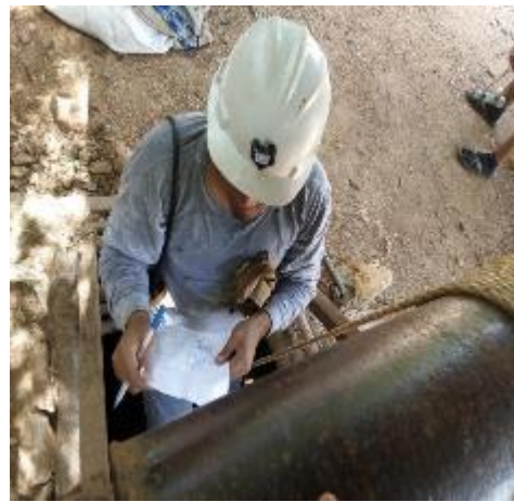
Illustration 14: As part of the inspections carried out, depth of workings and type of support are evaluated at the worksite

As part of La India Gold SA contribution made to artisanal miners there was a reopening for ore extraction in La Mestiza, where 168 artisanal miners are currently benefitting, these are grouped into 36 groups.