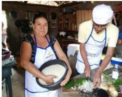
Illustration 181: Basic cooking course.