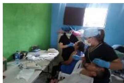
Illustration 2: Dental team.

Dental day. a dental day was held for miners' members of the cooperative COOPTRAMIN, where fillings, extractions and dental cleaning were offered. This activity was coordinated with UNAN - León. A total of 25 members participated