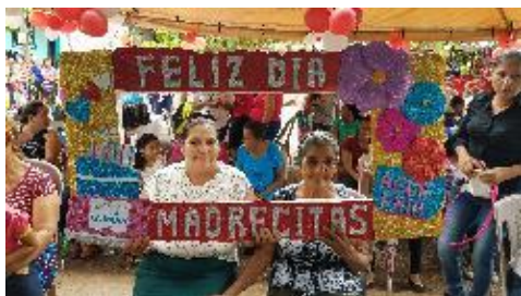
Illustration 20: Celebration of Mother's Day in Agua Fría.