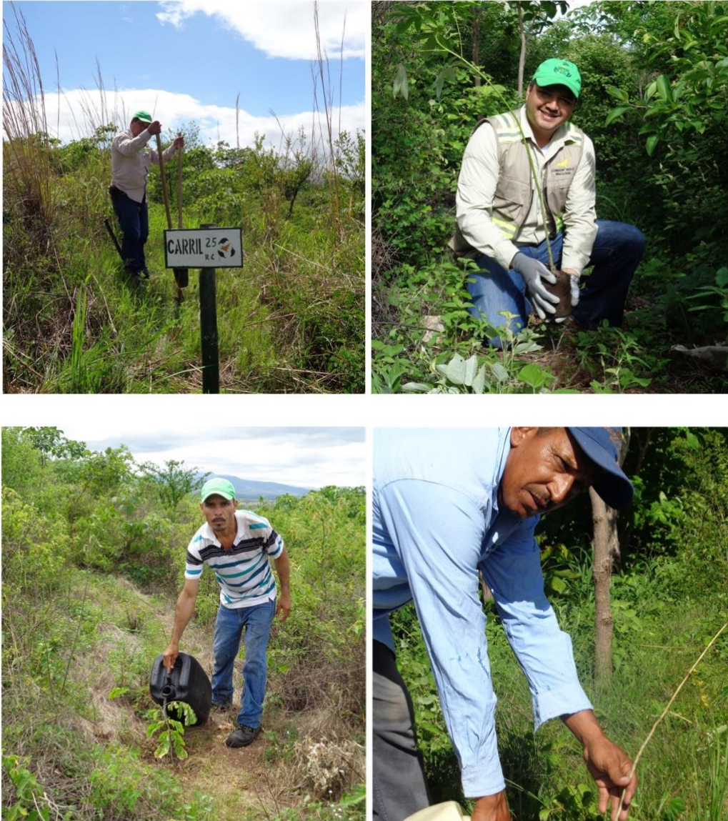
Photograph 3.3.3.2. Maintenance, reforestation and watering the plants in reforestation area of Real de la Cruz concession

A new area of 2.9 ha will be fenced, and we will begin reforestation this year. This is part of the compensation plan included in the Environmental Permit for exploration of Real de la Cruz.